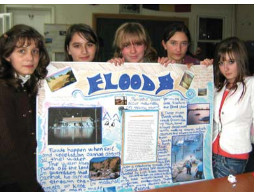
Scoala Horea in Cluj-Napoca, Romania worked on Natural Disaster Prevention and Mitigation

Challenge 20/20 students form authentic bonds with students from around the globe. They learn first-hand about cross-cultural communication. Together the teams tackle a real problem and their interaction opens up new perspectives and networks. Partnerships can continue after the Challenge 20/20 project and linkages such as teacher and student exchanges may develop.