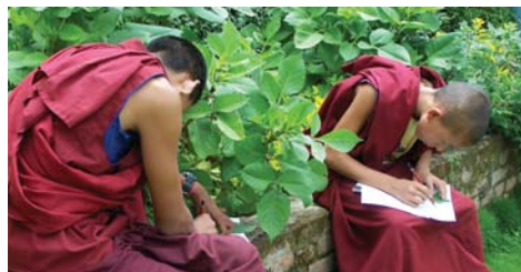
Students from Manjushri Di-Chen, Buddhist Learning Center, Kathamandu, Nepal

Challenge 20/20 brings together schools in the United States with schools in other countries. Together they identify local solutions to a global problem.